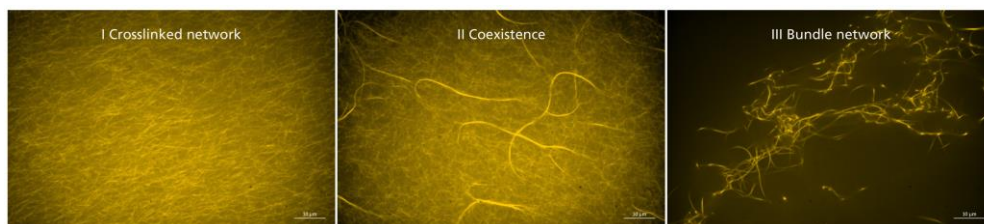
Figure: Synthetic crosslinkers influence the elasticity of actin networks. This behavior can be attributed to different structural morphologies within the network. Fluorescence microscopy.